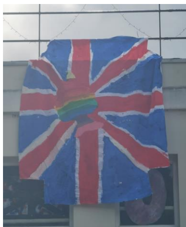
Holiday club's Jubilee banner