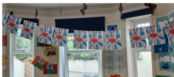
Little Dragon's bunting