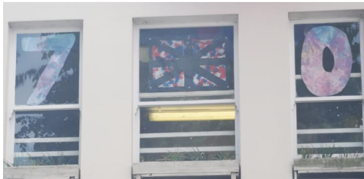
Moles display window