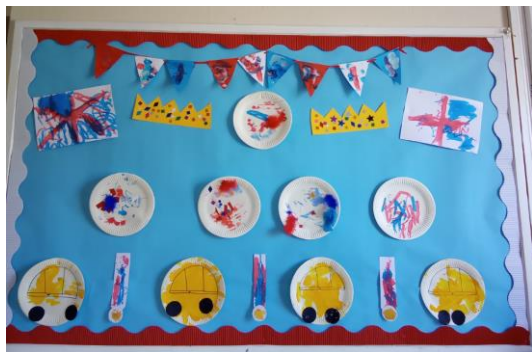
Hedgehogs display board