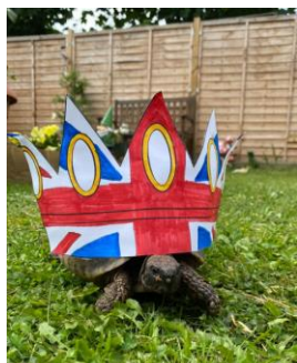
Freddie the Tortoise who came to visit Badgers